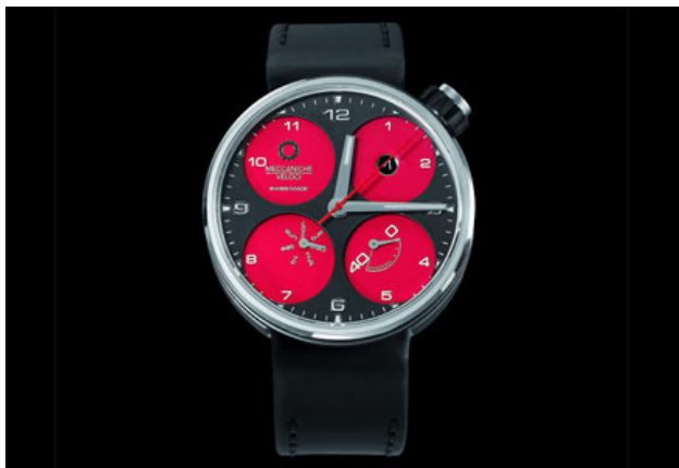
The 44mm Power Reserve Quattro Valvole watch.