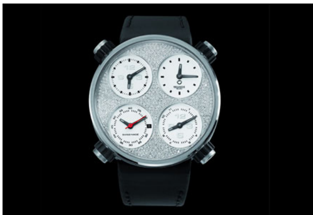
A diamond set Meccaniche Veloci from the Luxury Collection.