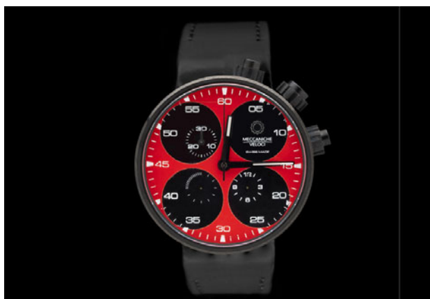
The Race Car watch from the Only One Collection.