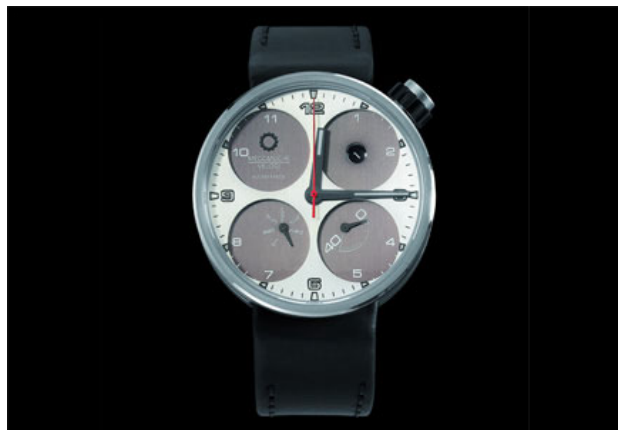
The 42mm Quattro Valvole Power Reserve watch by Meccaniche Veloci.