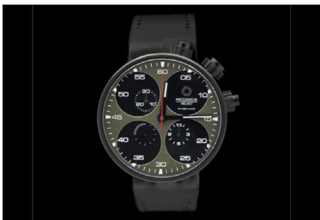
The Air Helicopter watch from the Only One collection.