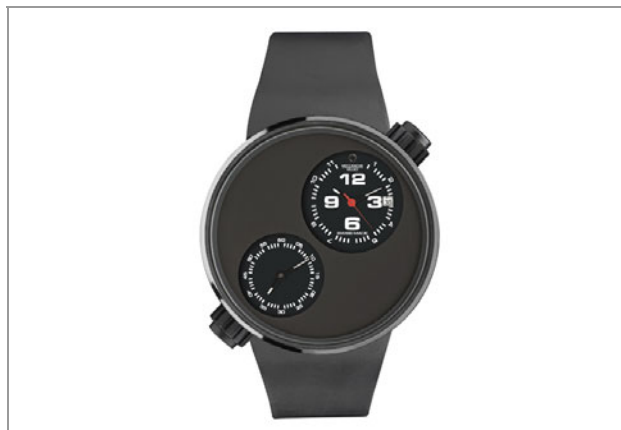
The Due Valvole watch.