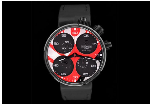
The Race Motorbike timepiece from the Only One collection by Meccaniche Veloci.